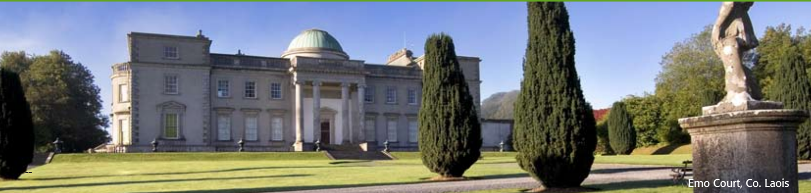
Emo Court, Co. Laois