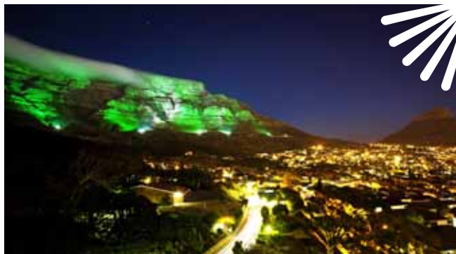
Pictured above: The London Eye; Prince's Palace, Monaco; Leaning Tower of Pisa, Italy; Empire State Building, New York; Table Mountain, Cape Town.